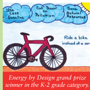
Energy by Design grand prize winner in the K-2 grade category.

For the 2007-2008 school year, we received 928 entries and noted a 30% increase in community participation. The winners were awarded prizes at school assemblies. Nicor is proud to work with future generations to ensure energy is used wisely for years to come.