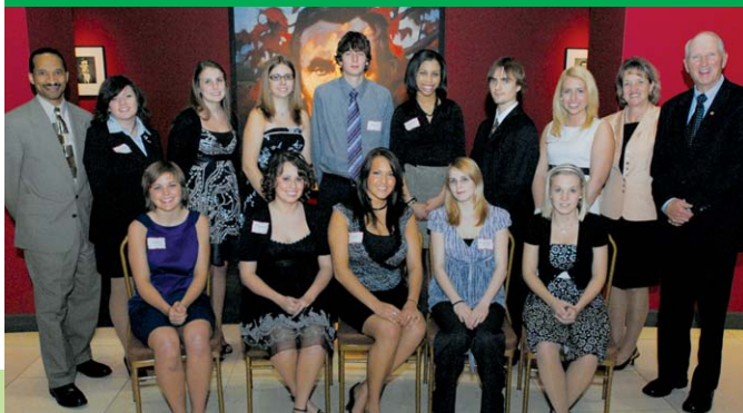
2008 Lincolnland Legend scholarship recipients.

Earlier this year, we sent you a summary of Nicor's 2007 giving results, which provided information on all of our philanthropic initiatives. As you read in that publication, Nicor supports a number of worthwhile organizations and programs throughout the year, but we wanted to take this opportunity to tell you more about our focus on education and the programs we support that are enriching the lives of children throughout our service territory.