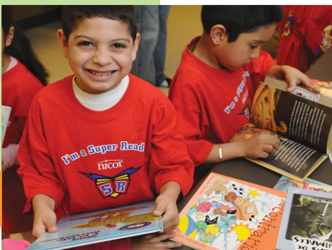
Students enthusiastically select a free book at an Adventures in Reading with Nicor book distribution.

During the 2007-2008 school year, we gave away more than 6,000 books to students at two schools and encouraged them to read more than 33,700 books.