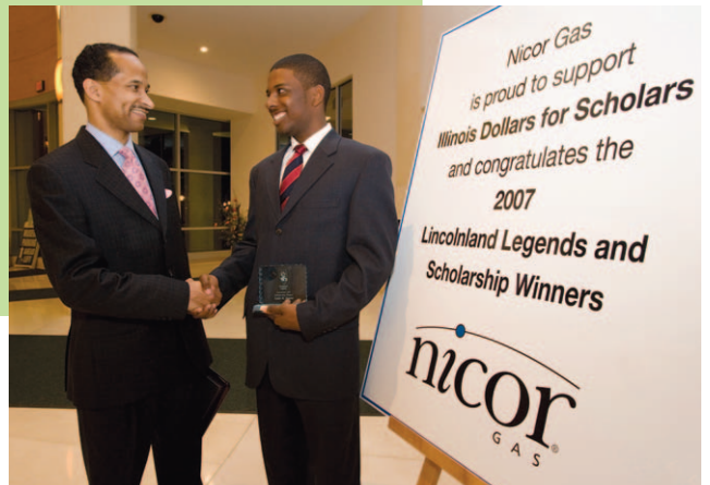
Award presentation for Lincolnland Legends, one of the Dollars for Scholars-funded scholarship programs.

We are committed to maintaining communications with you and want to hear your thoughts about this informational brochure, our giving efforts, or anything that's on your mind related to Nicor's involvement in the community. Please use this form to ask questions, make recommendations and provide updated contact information. You may also send your feedback to us at corpcom@nicor.com .